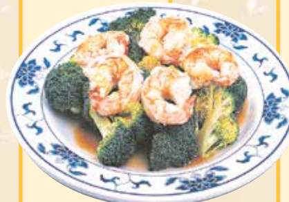
Shrimp w. Broccoli