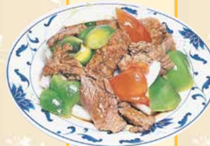
Pepper Steak w. Onion