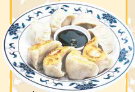
Fried or Steamed Dumpling