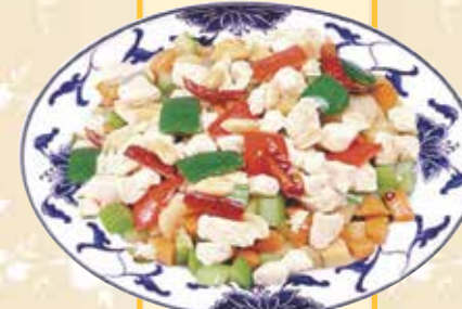
Chicken w. Peanuts