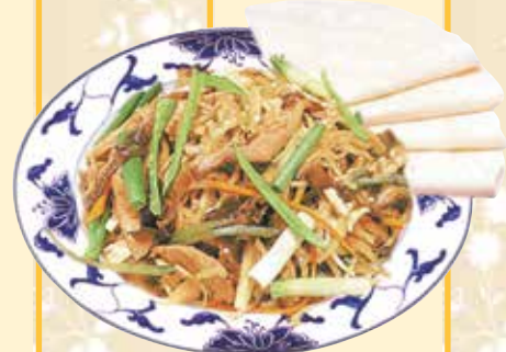
Moo Shu Pork