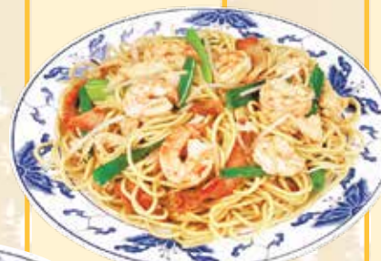
House Special Lo Mein